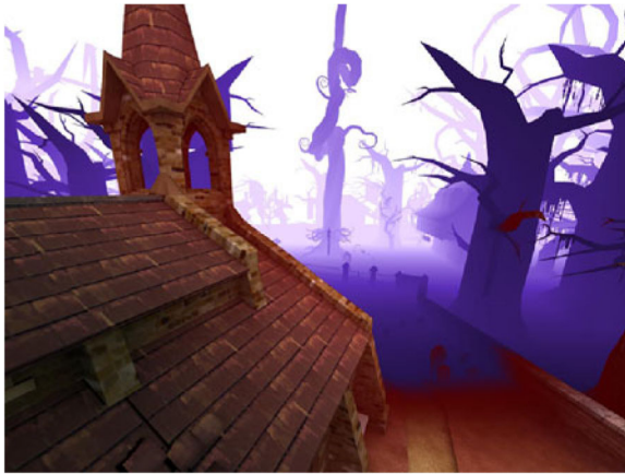
Fig. 2 A screenshot of Technically Finished's 2009 video game Haerfest , showing a first-person simulation of the combination of a bat's short eyesight and one instance of its echolocation system (used with permission)

Haerfest grants access to a world to be explored with a particularly non-human system of perception that, although unverifiable in its correspondence to that of actual bats, is incongruous with the way people ordinarily relate to the actual world. Even if contemporary virtual technology cannot yet objectively reproduce the subjectivity of a bat, it does offer ways to reveal previously inaccessible, modal aspects of the way humans can relate to reality. The crucial point in this understanding of the ontological relevance and cultural role of interactive digital media content is that computers prompt humans to apply their perceptive, cognitive and operational equipment to virtual contexts that could not be encountered in their ordinary life. In synthesis, by materializing virtual worlds and granting the possibility to establish stable cognitive and interactive relationships with them, computers effectively function as heuristic instruments.