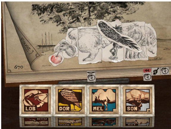
Fig. 4 Feeding the beasts in Gua-Le-Ni ; or, The Horrendous Parade does not only temporarily stop their relentless stampeding but can also modify the beasts' composition, quell their acceleration, or increase their value in terms of points (pages) awarded upon its correct cataloguing

The philosophical endeavor that will be presented in this article was pursued embracing virtual worlds not only as inherent factors of cultural change, but also as media that can present experiences and notions in ways which are alternative to, and